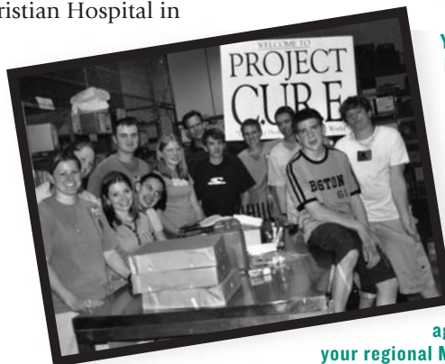
Young volunteers from First Presbyterian and Immanuel Presbyterian churches in Albuquerque, NM help sort and pack medical supplies at a warehouse run by MBF's partner Project C.U.R.E. MBF welcomes volunteers of all

ages. Please contact your regional MBF office or the international office for information.