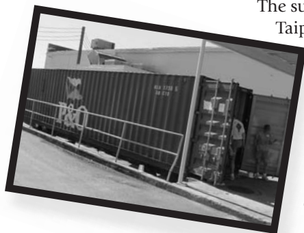
One of the 40-foot containers the volunteers filled with donated medical supplies and equipment to ship to overseas PC(USA) partner hospitals and clinics.