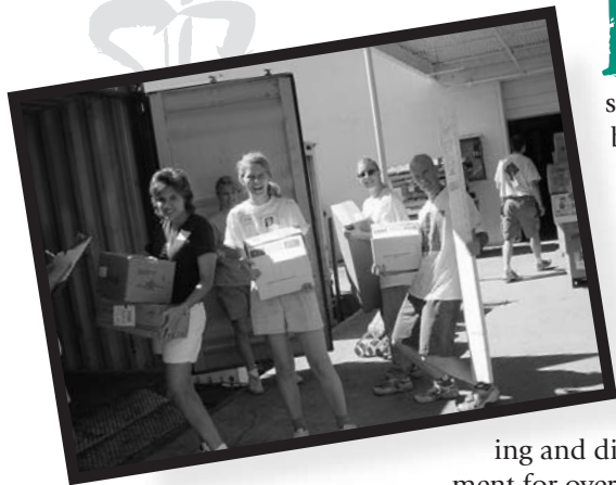
Volunteers from Memorial Drive Presbyterian Church in Houston fill a container for an overseas hospital at the MBF/Project C.U.R.E. Center in Houston.

In response to an urgent request from Taiwan, the Medical Benevolence Foundation (MBF) and Project C.U.R.E. have shipped 5,000 surgical masks to Taipei to help battle the SARS epidemic.