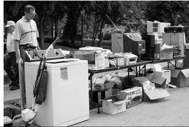
(right) Yard sale items included everything from toys, books, and household goods, to washing machines and vacuum cleaners—even the occasional car or boat.