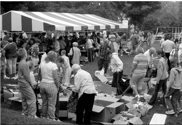
(left) The whole community turned out for First Presbyterian’s annual yard sale.

We at the Medical Benevolence Foundation would like to thank all of the individuals and congregations who, like First Presbyterian Church of Jefferson City, TN, find unique hands-on opportunities to work on mission projects that support MBF’s healing ministry.