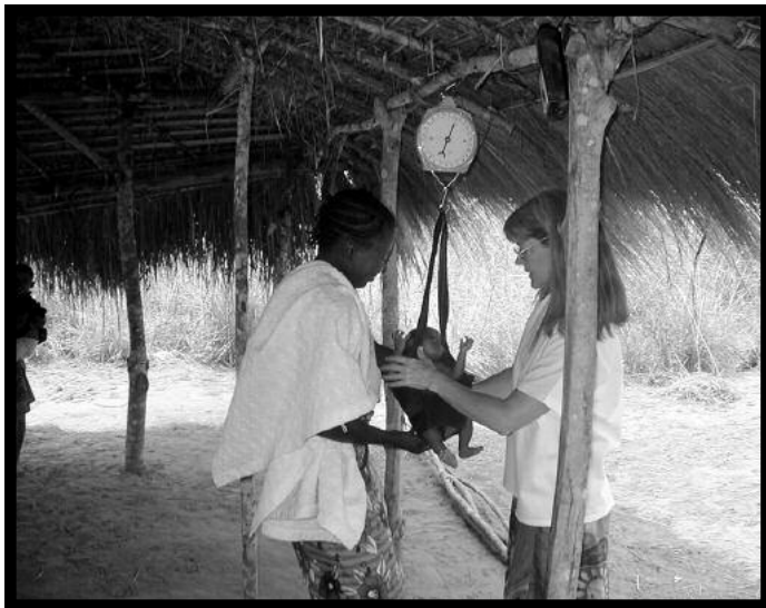
A mission worker weighs a baby at a mobile clinic in DR Congo.

After the role play, children discuss the activity and are given an opportunity to collect money for mobile clinics in a cardboard coin bank shaped like an ambulance.