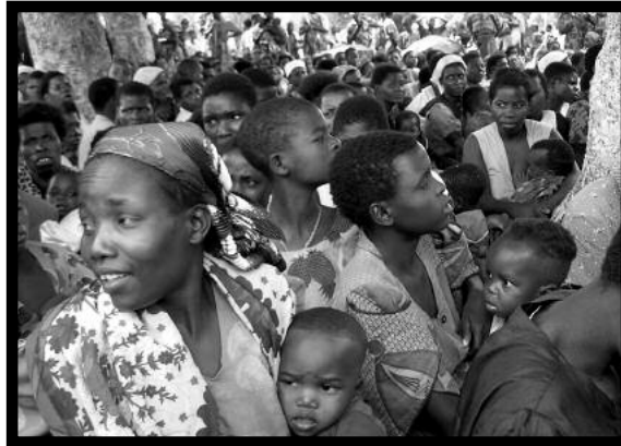
Malawi women stand in line to receive a small government issue of maize.

In a country where the average life expectancy is only 35 and where Malaria, TB, and HIV/AIDS regularly take their toll, the current food crisis increases the burden of mission health workers and the Church of Central Africa Presbyterian (CCAP).